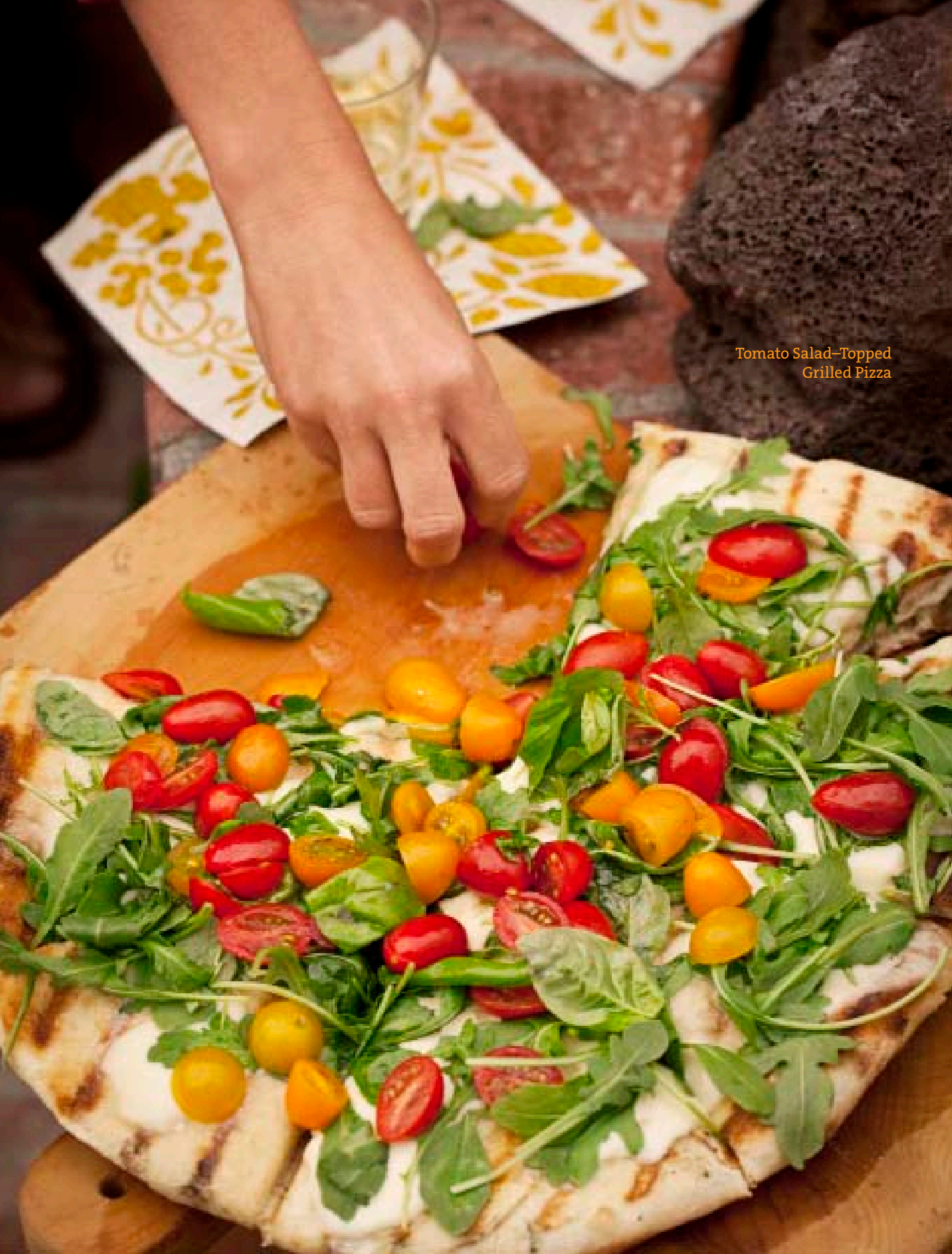
Tomato Salad-Topped Grilled Pizza