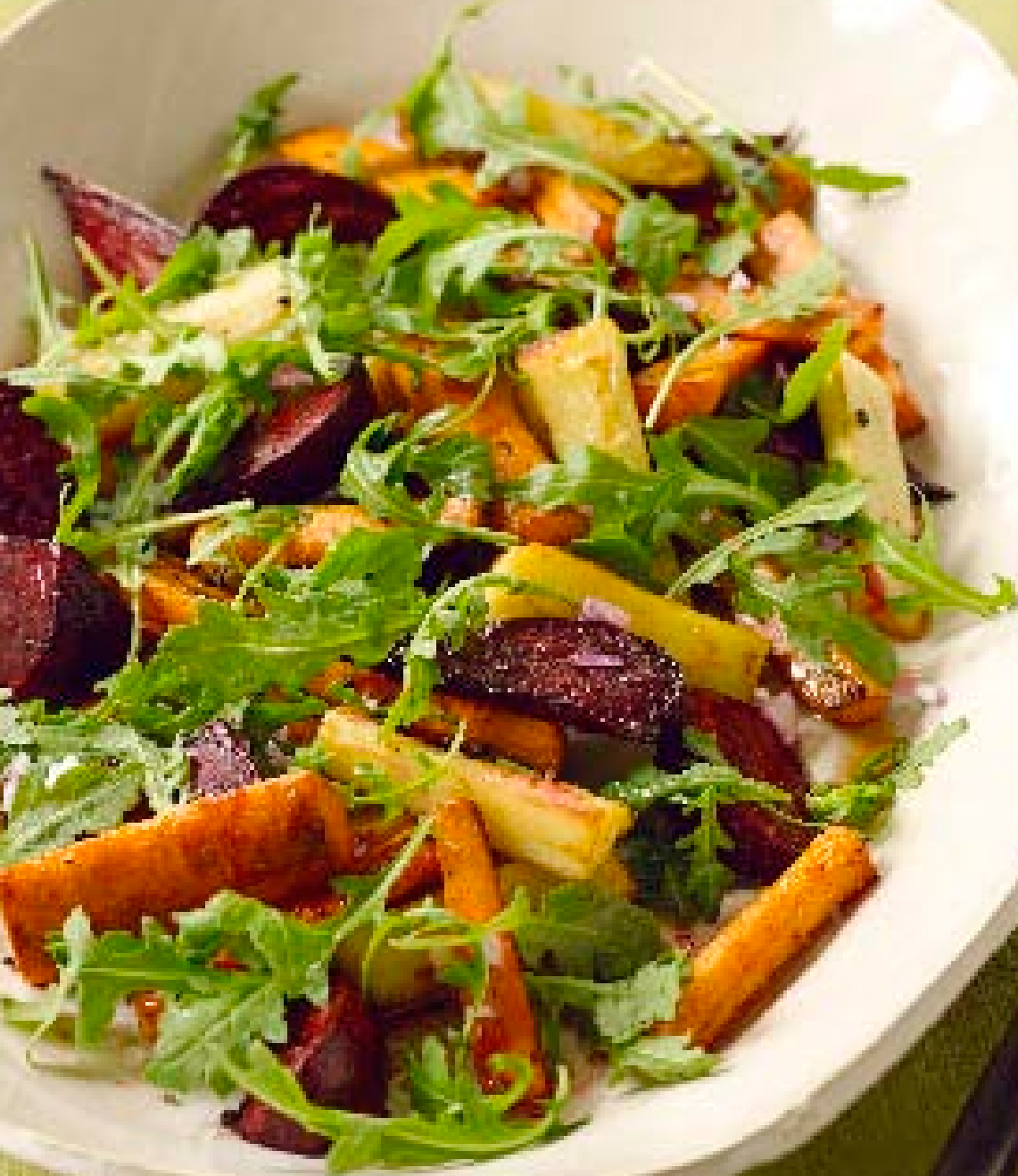
Roasted Root Vegetable Salad with White Wine Vinaigrette