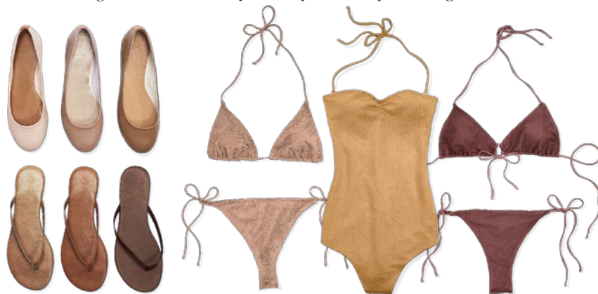
Tkees flats, $95, flip-flops, $48; tkees.com.

A: Fashion designers often use the word nude when they really mean beige . What I mean when I use that term, however, is a shade that matches your complexion, whether it's ivory, olive, or dark brown. I'm a huge fan of skin-toned footwear for making legs look longer. Nine West, Steve Madden, and Stuart Weitzman offer a range of caramel and chocolaty shoes. And I'm so impressed by Tkees sandals and ballet flats: With six "makeup foundation" shades, everyone can find her perfect pair. Meanwhile, flesh-toned clothes are versatile, slimming, and sexy; try a blouse or skirt, and you'll see what I mean. And although nude swimwear is often a disaster, I was happy to discover Lycra and mesh bathing suits by Cali Dreaming that blend in with your body—naturally flattering!