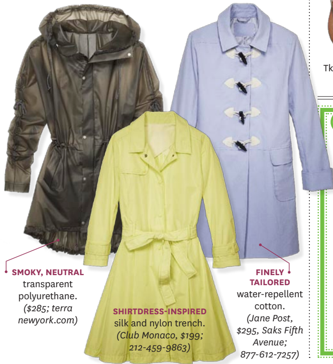
SMOKY, NEUTRAL transparent polyurethane. ($285; terra newyork.com)

When it rains, it pours—great-looking raincoats are everywhere this season! Three I love: