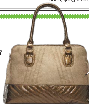
YOU'D NEVER KNOW this elegant fabric satchel, lined with recycled satin, isn't made of leather. (Reveal, $169; revealshop.com)

Every year I'm more amazed by the strides being made in organic, vegan, recycled, sustainable, and otherwise Earth-friendly fashion. A couple of especially inventive, polished accessories prove how far we've come from stiff faux-leather purses and hemp sandals.