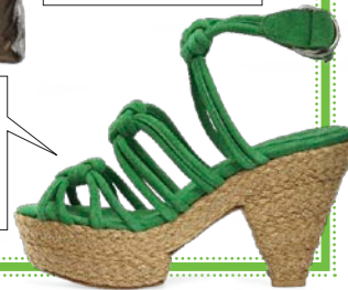
SUEDE-LIKE STRAPS are made from soda bottles; renewable raffia wraps the platforms. (Daniblack, $185; jildor.com)